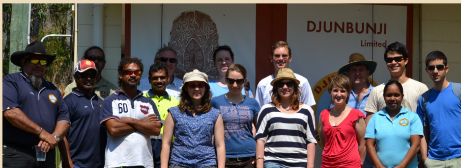
Griffith University students visiting Djunbunji Headquarters on 26th September 2011