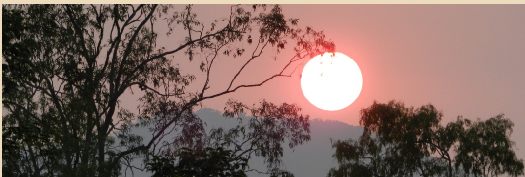
Sunrise over Grey Peaks National Park.

I am pleased to advise all Mandingalbay Yidinji People that at the first Board Meeting of the new board elected at our Giangurra Annual General Meeting on the 9th November that I was elected as the new Chair of Djunbunji Ltd for 2011/12. I look forward to working with my fellow board members over the next year and the Mandingalbay Yidinji community in general.