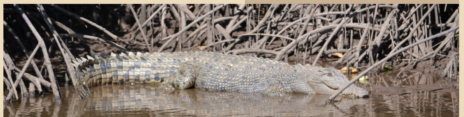
Top: Applying 'vigilant' to Pond Apple trunks. Centre: Pond Apple on East Trinity Reserve. Bottom: Crocodile resting by the banks.